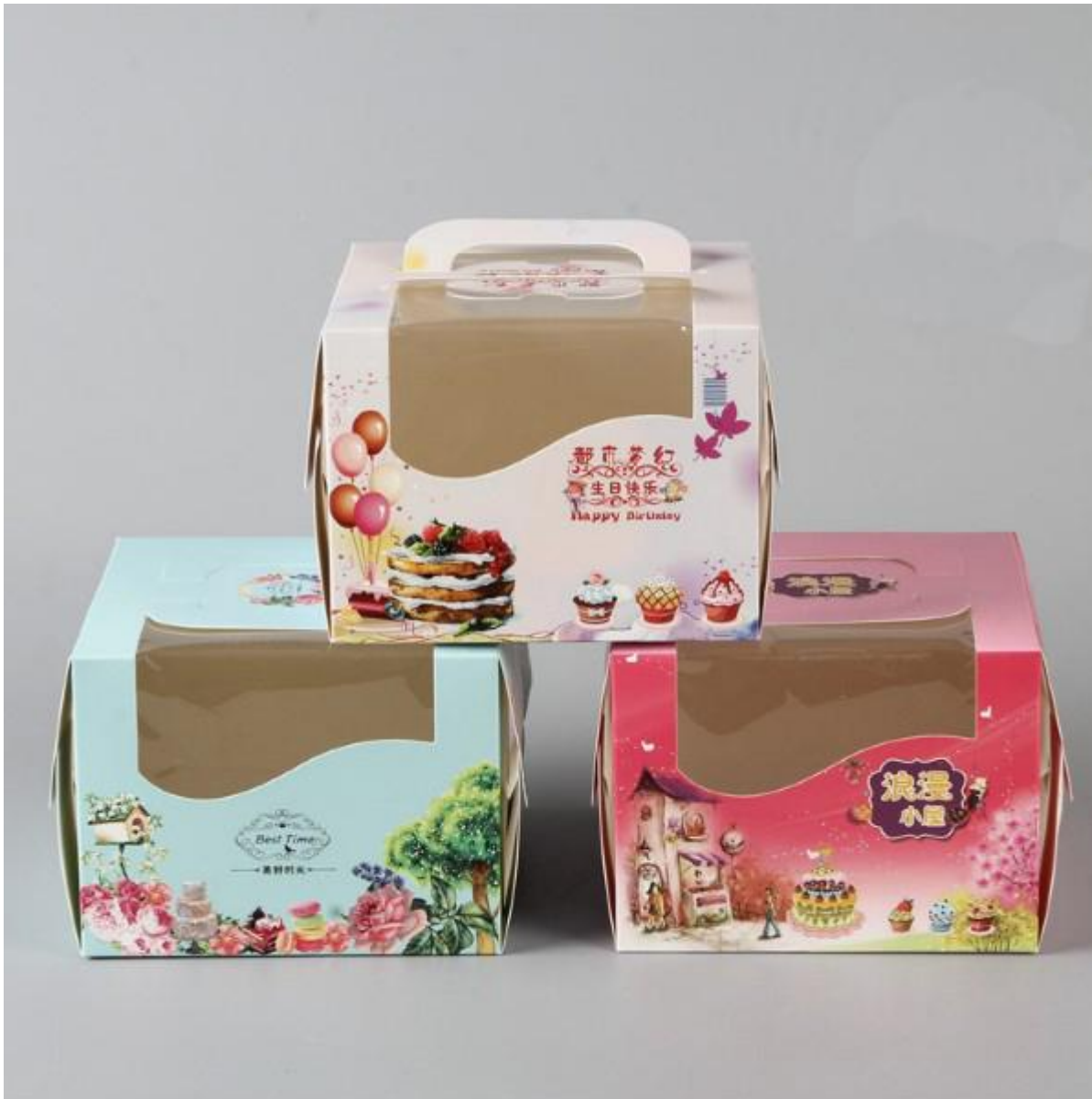
Sinst Window Boxes for Cream Cake Process