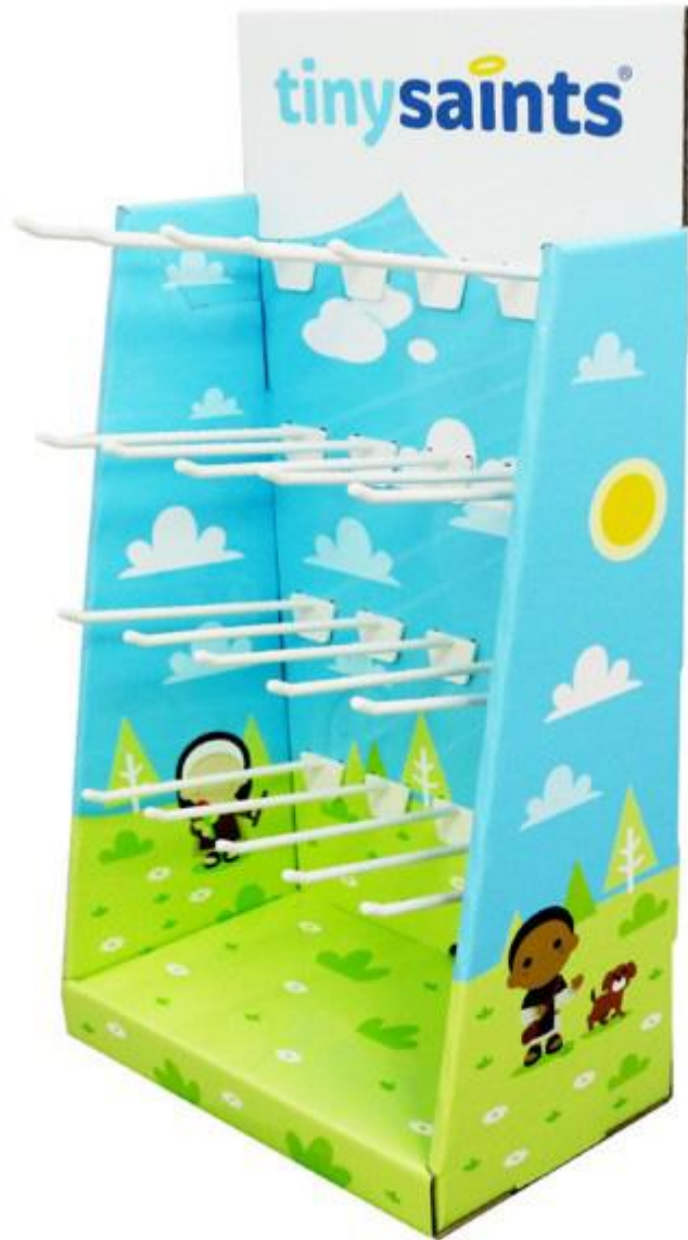
Sinst Cardboard Pegs Display Stand for Glove Process