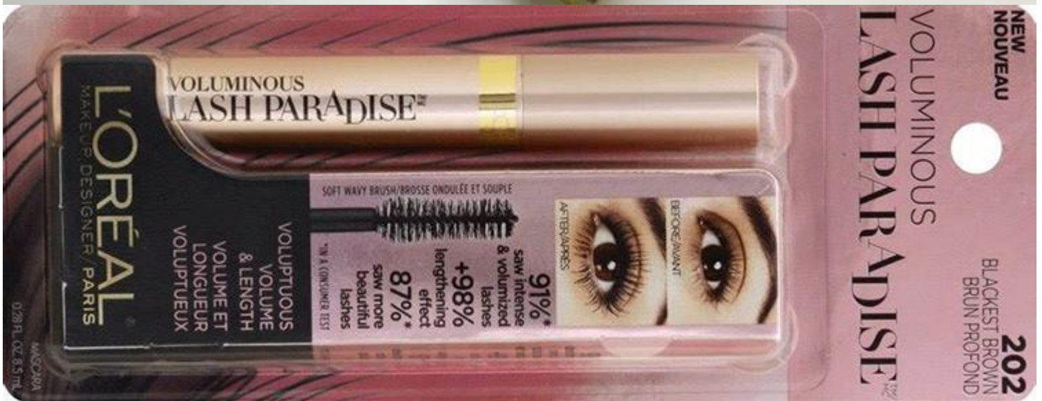
Sinst Blister Packaging Boxes for Eyelash Pencil Process